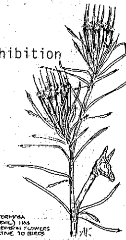
LAMBERTIA FORMOSA (SPRINGBUSH DEVIL) HAS HONEY-RICH CEREAL FLOWERS VERY ATTRACTIVE TO BEES