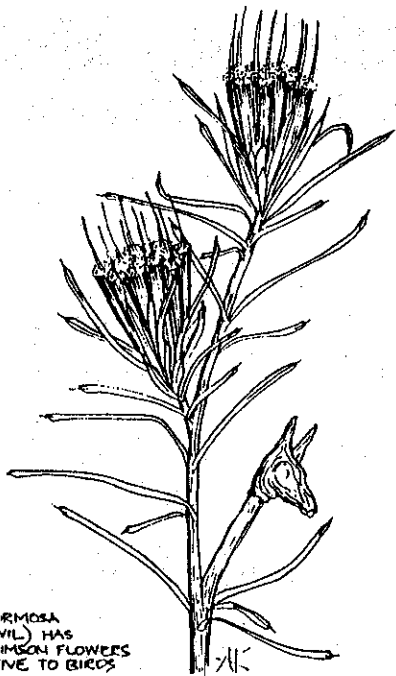
LAMBERTIA TERMOSEA (MOULDER DEVIL) HAS HONEY-RICH CRIMSON FLOWERS VERY ATTRACTIVE TO BIRDS