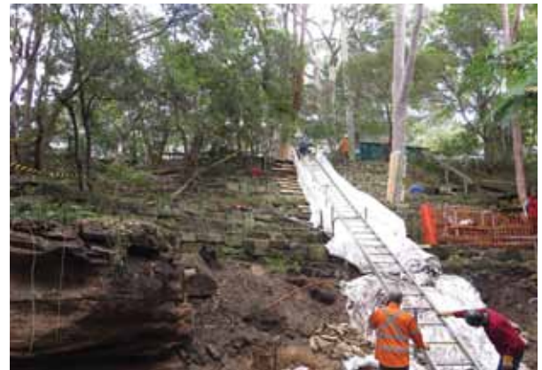
Demolition works

The present DA plan is to re-align much of the stone seating on the western terrace