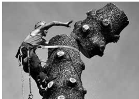
Trees lawfully coming down

the review do little to wrest back any control to Council authorities.