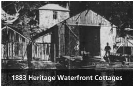
1883 Heritage Waterfront Cottages

In 1883 the Horsley Estate existed in Castlecrag. It was a boat building foreshore community. This stone cottage was one of thirteen cottages, boat sheds and workshops that formed part of this community. Now, only three cottages survive. Two of them are Hudson prefabricated kit homes circa 1901, which