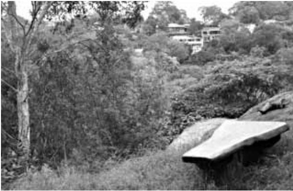
Oriel Reserve

For the past 11 years, local Bushcare volunteers gather monthly every third Sunday at 9am in the little Oriel bushland reserve. We burnt, we planted and above all we weeded to transform a dark foreboding monoculture of Pittosporum into the light-filled diverse vegetation community that exists today.