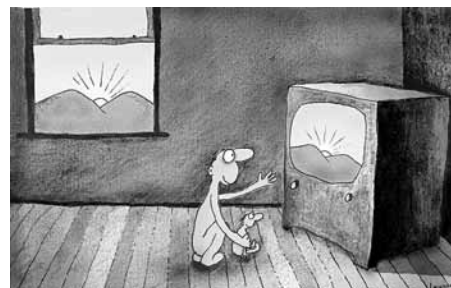
Screen Time – Our thanks to Leunig.

Children today have less time for unstructured, creative play in the outdoors than ever before in human history. I was lucky enough to spend a morning with the