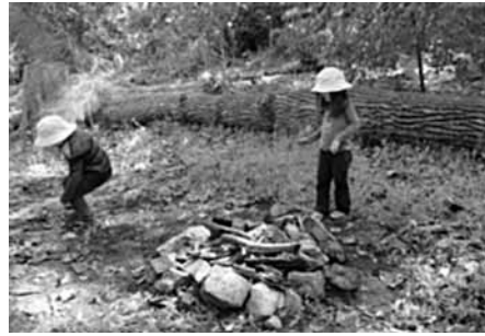
Nali and Tom spent considerable time, first with Nicole, but then on their own co-operatively collecting rocks to make a big round fireplace.

The cubby builders strengthened their structure and talked about what leaves might make a good carpet. Deep learning was taking place as children problem-solved and engaged in creative thought. There's so much to explore and be curious about in the natural world! The Educators were following the children's lead, which is a strong part of the philosophy.