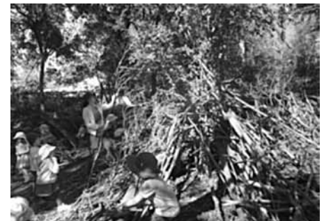
Cubby builders hard at work.