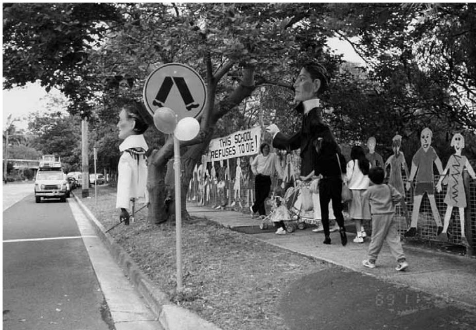
Marion and Walter Griffin puppets lead the Save Our School campaign in 1990.

Twenty five years ago, this newsletter featured the fight to save the local public school from being closed and sold off for medium density housing. The community mounted enormous opposition because the school was fully enrolled and it was obvious, even then, that the need would only increase with Sydney's growing population.