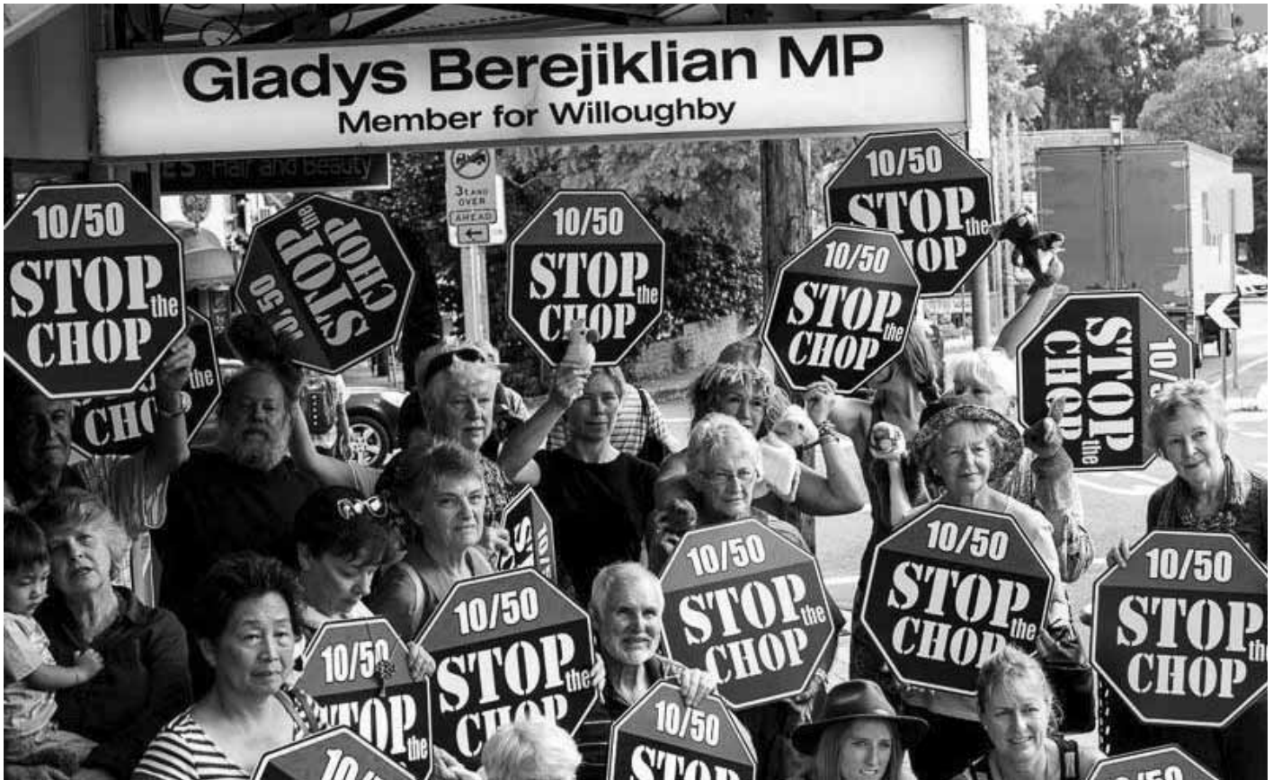
Stop the Chop members demonstrating outside the offices of Gladys Berejiklian, our local State MP.