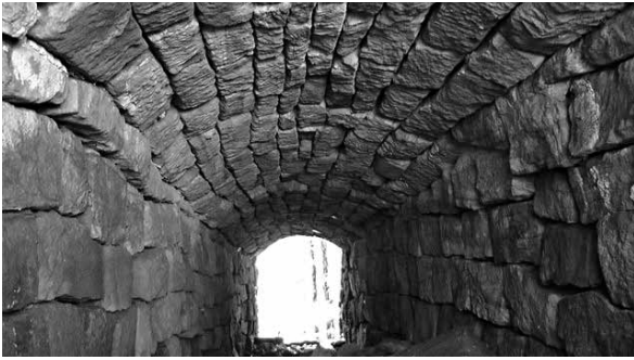
Figure 1: Inside the culvert.

On 30 August 2011, Council advised the CPA that the old stone culvert at the lowest point in The Bulwark was in danger of collapse and needed "reinforcement". The problem was mainly a consequence of the soil under the road surface being washed out by occasional breakages in the water mains in the road. This had caused some collapse of the road surface and some bulging in the stone walls on the eastern side of the bridge.