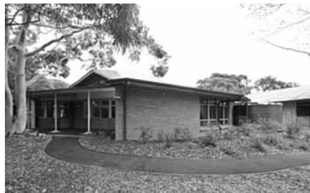
Marion Mahony Griffin Hall.