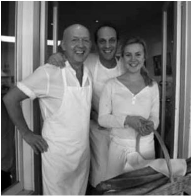
The team from Marthas.