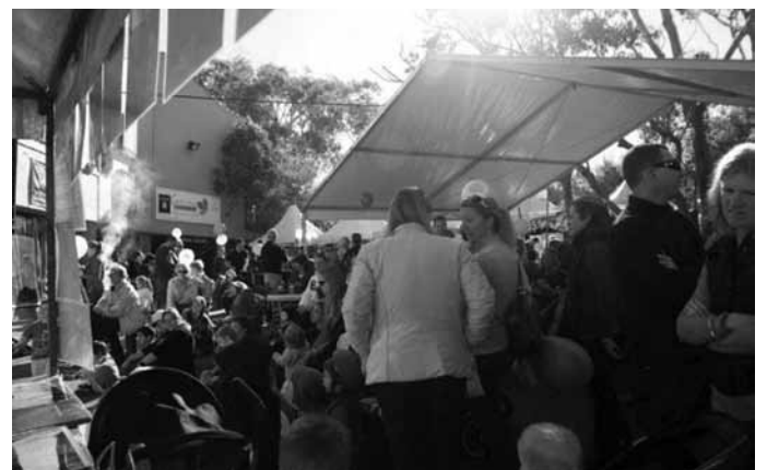
The crowds around the bandstand.