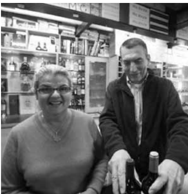
Castlecrag Cellars.