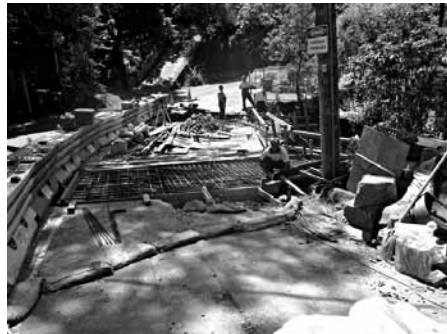
Figure 2: Works underway.

Finally in early March this year work commenced on the repair to the bridge. This was a very complex process that had to be juggled with half road closures and possible noise disturbance to locals. The Contractor visited all the houses in the area and was very cognisant of, and sympathetic