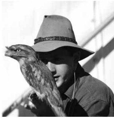
A Tawny Frogmouth was one of the stars at the Fair.