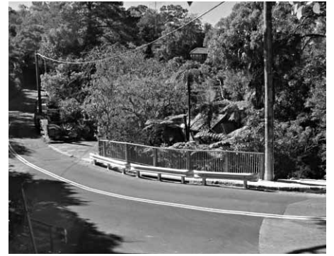
Figure 3: Works complete.

to, the concerns of residents. Council engineers visited the site almost daily and the work proceeded at a good pace given the difficulties encountered – mainly very unstable fill under the road and lots of rock to drill with the coring machine. Some appreciation of the scope of the work can be seen in Figure 2, when the work was underway.