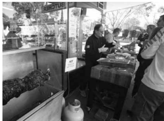
Castlecrag Meats' Pork Rolls.