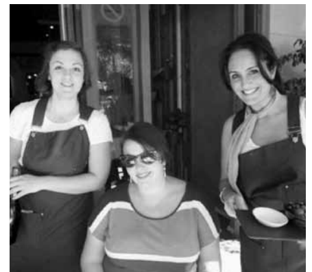
Enjoying lunch at Artusi.