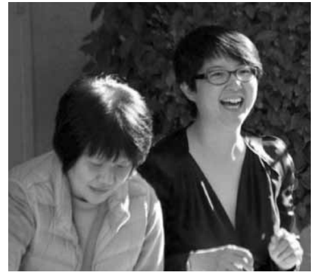
The smiling face of Flavors of Peking.