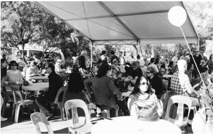
Enjoying the food and music.