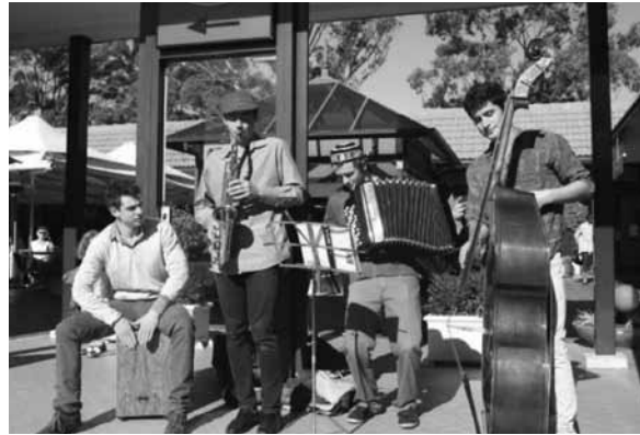
Musicians at The Quadrangle.