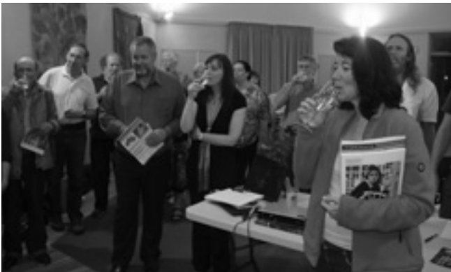
Toasting 30 years.

The Willoughby Environment Protection Association (WEPA) recently celebrated its 30th year. This is a very notable achievement for one of our most prominent local groups.