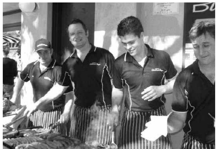
Butcher Boys staff at barbecue.