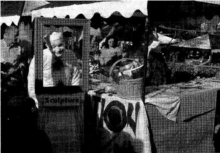
Crowds enjoy their day out at the 2005 Castlecrag Community Fair.

Castlecrag Fruiterers; Mia Boutique; Castlecrag Cellars; Castlecrag Florists.