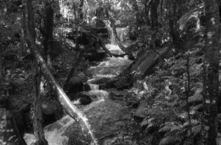
The Creek in Retreat Reserve in flood on the morning of 2 January, 2007

The project initiated by the Castlecrag Progress Association in early 2001 to plant trees along Edinburgh Road to mark the Centenary of Federation, progressed significantly during December 2006. As outlined in The Crag No.135 (February 2001, p.3) the idea for the project came from the key role that Walter Burley Griffin played in the design and construction of our national capital, the symbol of the Federation of the Australian colonies. Accordingly, the Progress Association proposed to Willoughby City Council that locally indigenous trees be planted along Edinburgh Road to form a living green sculpture. This would be a memorial to Castlecrag's association with the Griffins and an acknowledgement of the significance of our natural environment. Several meetings were held with Council