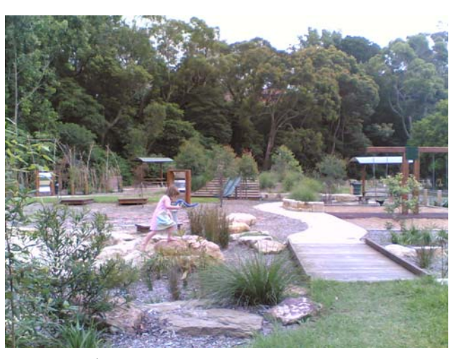
At play in Warners Park

sand pit, complete with a water pump, perfect for building dams and rivers. Adults are catered for as well, with two gas barbecues and three covered picnic tables waiting to host the next family outing.