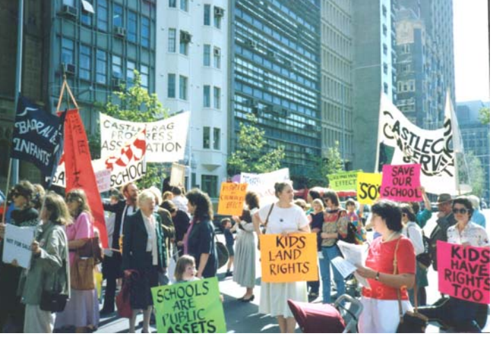
The SOS Crag rally at Parliament House in May 1989 to save the Castlecrag Infant's School.