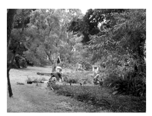
Residents planting in Lookout Reserve

Editor: Willoughby Council has an excellent Fire Hazard Reduction Team and residents are advised to contact them on this subject.