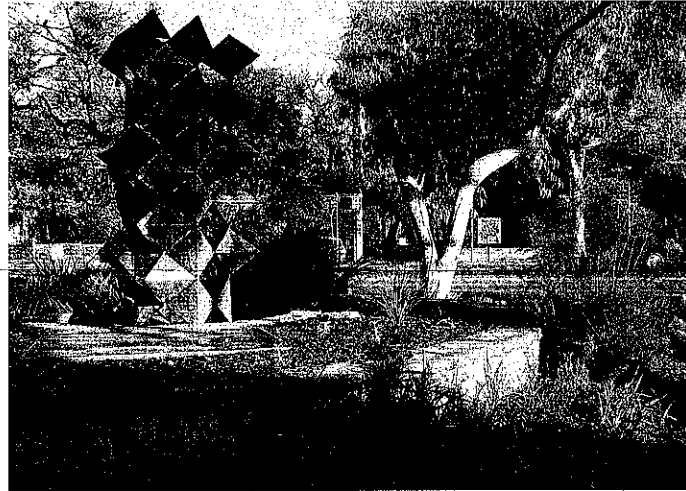
The Griffin Memorial Fountain again stands out as a beacon that symbolises Castlecrag's origins. This scene on 21 March 2006 shows the landscaped island. Next time we will show it with water.

All Castlecrag residents will have noted the refurbishment work being undertaken by Council on the Griffin Memorial Fountain at the intersection of Sortie Port and Edinburgh Road. The island has been landscaped, the bowl has been repaired, the pump and jets have been refurbished and new lights will shortly be fitted. Willoughby City Council undertook this work in close consultation with the NSW Heritage Office under its maintenance budget.