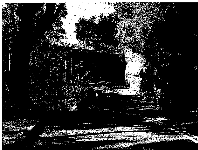
To resident and visitor alike, The Bulwark links them with nature as it meanders through the bushland, thereby presenting one of Castlecrag's most appealing streets.