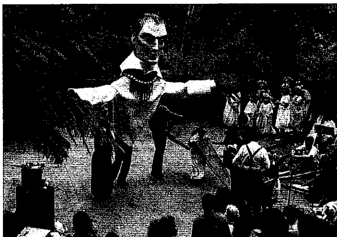
The performance of Marion's Gift at the Haven Amphitheatre.

1995 The Minister for Urban Affairs & Planning formally gazetted the Willoughby Local Environment Plan (LEP) 1995 on 15 November. Most of Castlecrag's residential areas were zoned as Residential-2A(2) Scenic Protection Zone, which requires housing that accommodates the scenic qualities and ecological values of environmentally sensitive natural areas by minimising impacts such