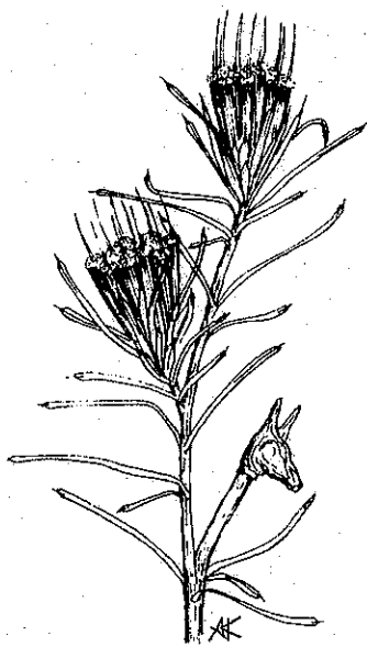
A.K LAMBERTIA FORMOSA