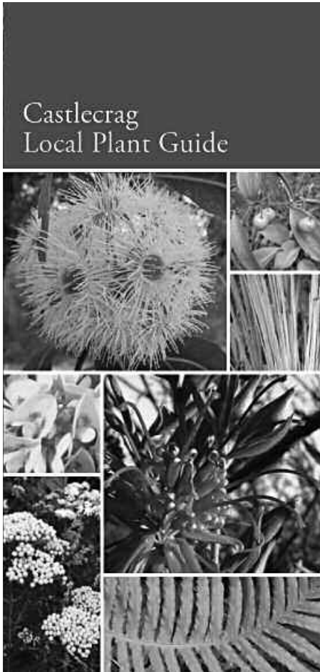
Above: The cover page of the Castlecrag Local Plant Guide. The final version may have minor changes from the images shown here.

It has been a long and tortuous journey, but the Castlecrag Local Plant Guide is in the final stages of production, with quotes from printers currently being evaluated. They will be available at the Castlecrag Community Fair in May. A copy will be delivered to each household in the suburb, and Willoughby City Council will also be distributing the booklet.