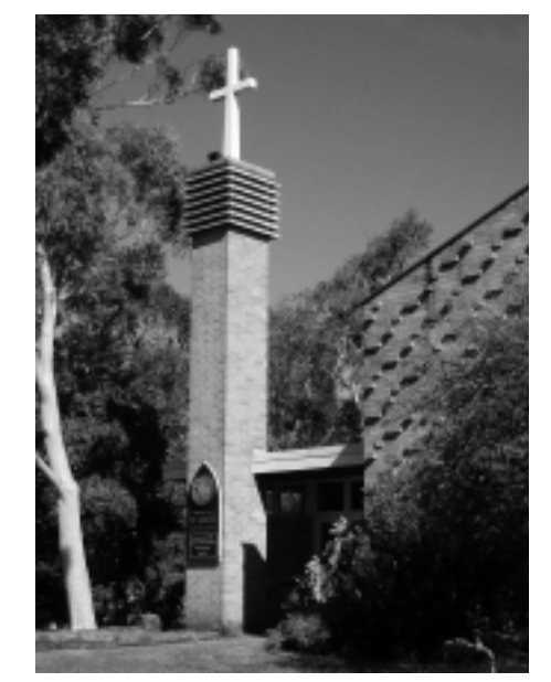
The spire of St. James Church, Edinburgh Road.

Each community group and organisation is founded on shared aspirations and beliefs and a common purpose. As each group interacts with the wider populace and other groups, it helps weave the rich fabric that makes a vibrant community tapestry. Accordinal even those who do not endorse every belief of another group have reason to celebrate its achievements as a contribution to the greater good of the community.