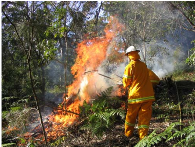
Phil Sarkies of Council's Bushfire Crew tends the Sunnyside burn on 28 July

preparation also reduces available fire fuel over the area and the burn can be conducted safely. This burn preparation technique also minimises air pollution and reduces the amount of water needed to manage the burn.