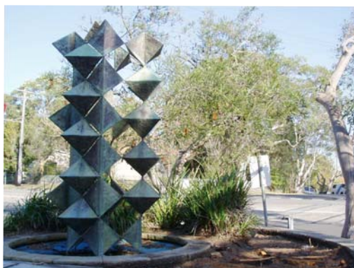
The Griffin Memorial Fountain in September 2005.