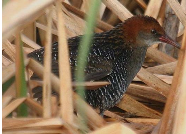
The rare Lewin's Rail was recently sighted in Castlecrag's Northern Escarpment.

The Fauna Study identified a number of areas that provide critical habitat for native animals, some of which are listed under State and Commonwealth legislation as threatened species requiring protection of their habitats, while others have become uncommon in the Sydney Region. The Powerful Owl and Red Crowned Toadlet fall into the first category, while the second includes the echidna, Glebe Gully Skink and Bibron's Toadlet.