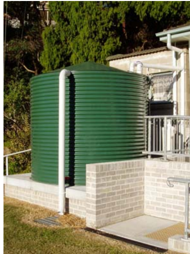
Demonstration rainwater tank

As the built environment has become more dominant, native vegetation has been lost and the creeks and bays have become degraded, especially after storms. Mark presented