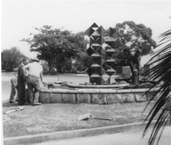
Construction of the Griffin Memorial Fountain in 1965. Note the crystalline shapes in freeform nodules of copper.

1972 The television documentary, Walter Burley Griffin: a draftsman who went to Australia , was produced by the Australian Broadcasting Commission. It reviewed Griffin's work in Melbourne, Sydney, Castlecrag and elsewhere.